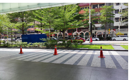
Drop off point